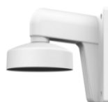
DS-1273ZJ-130 Wall Mount