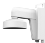
DS-1273ZJ-130B Wall Mount